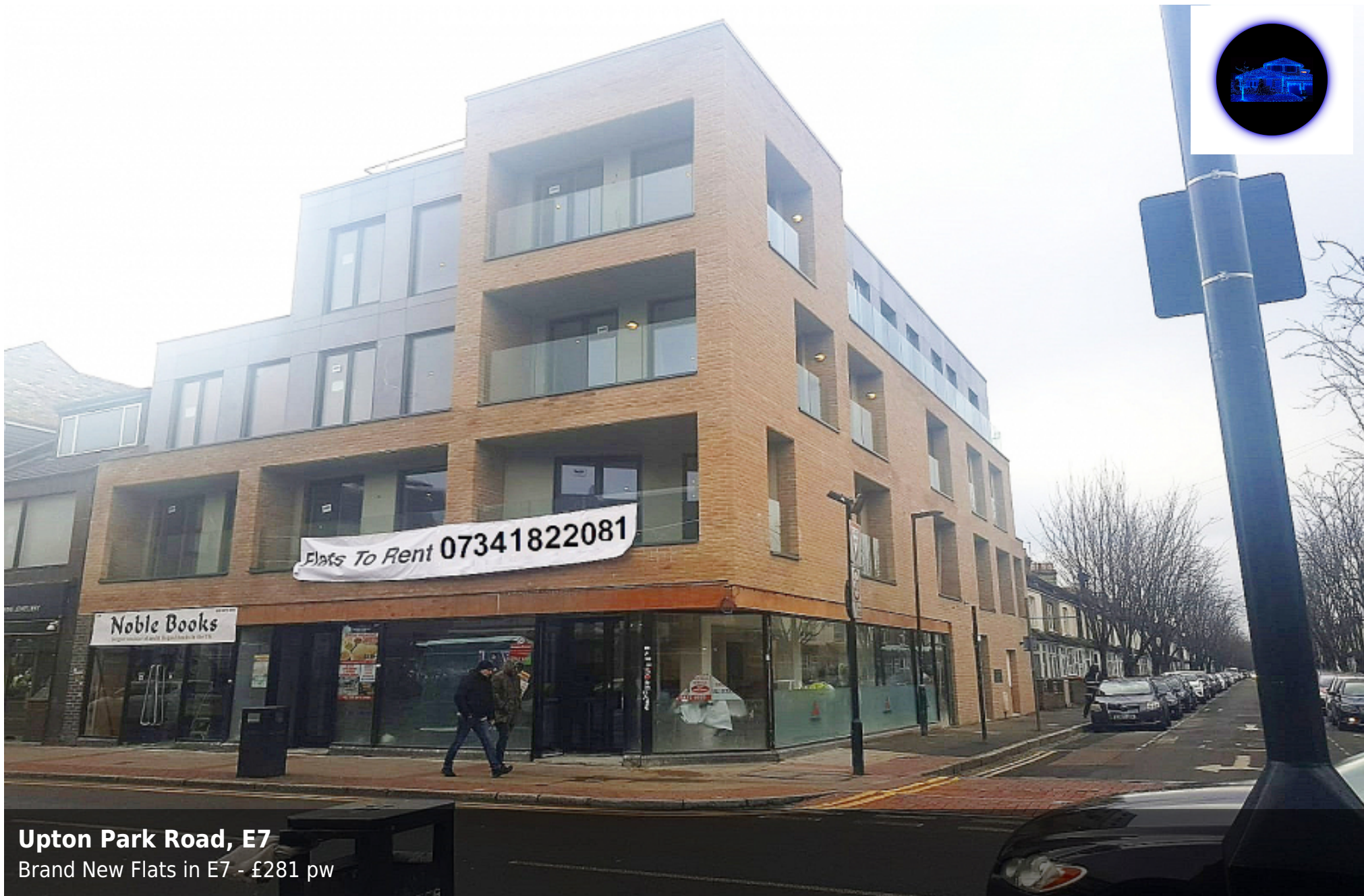
Upton Park Road, E7 Brand New Flats in E7 - £281 pw