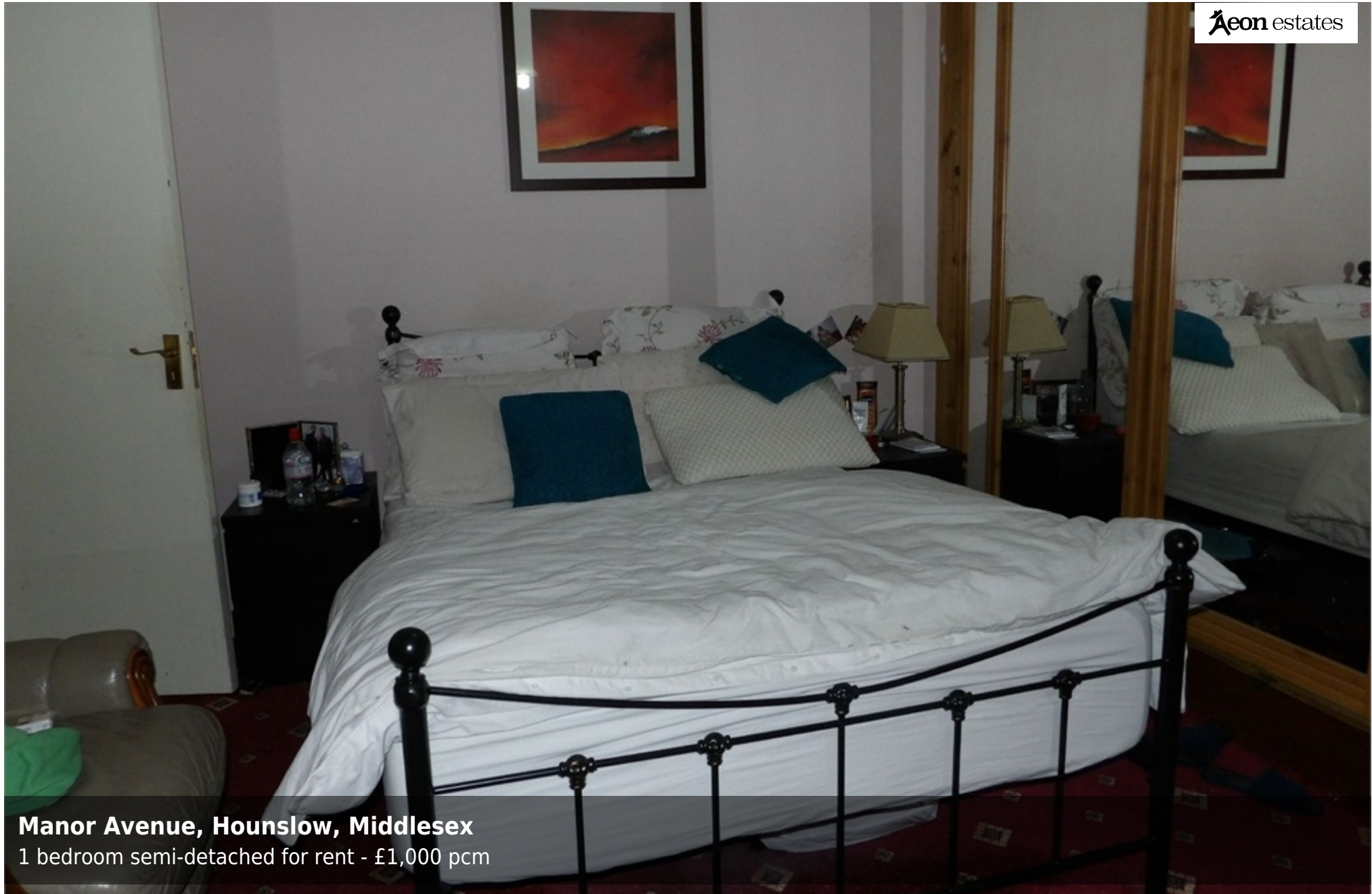
Manor Avenue, Hounslow, Middlesex 1 bedroom semi-detached for rent - £1,000 pcm