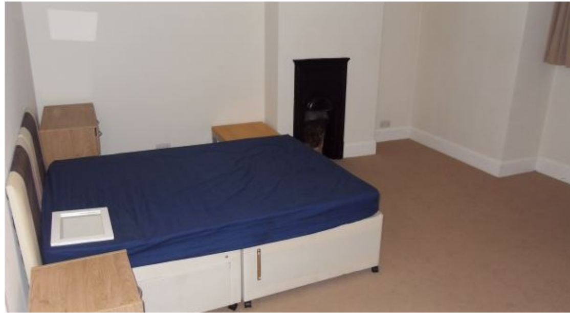
3 Double Bedroom Flat with 2 Shower Rooms