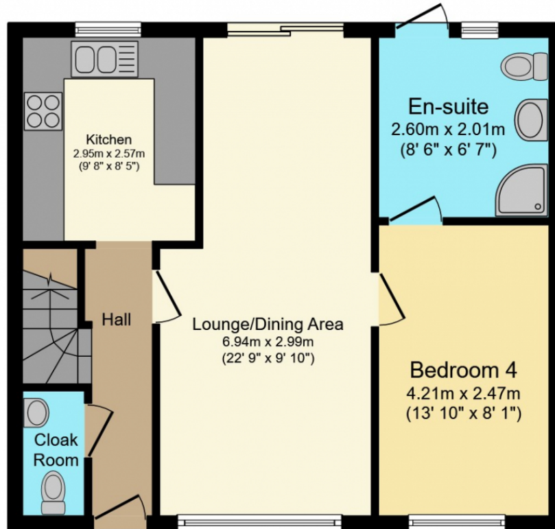
Ground Floor Floor area 84.7 sq.m. (912 sq.ft.) approx