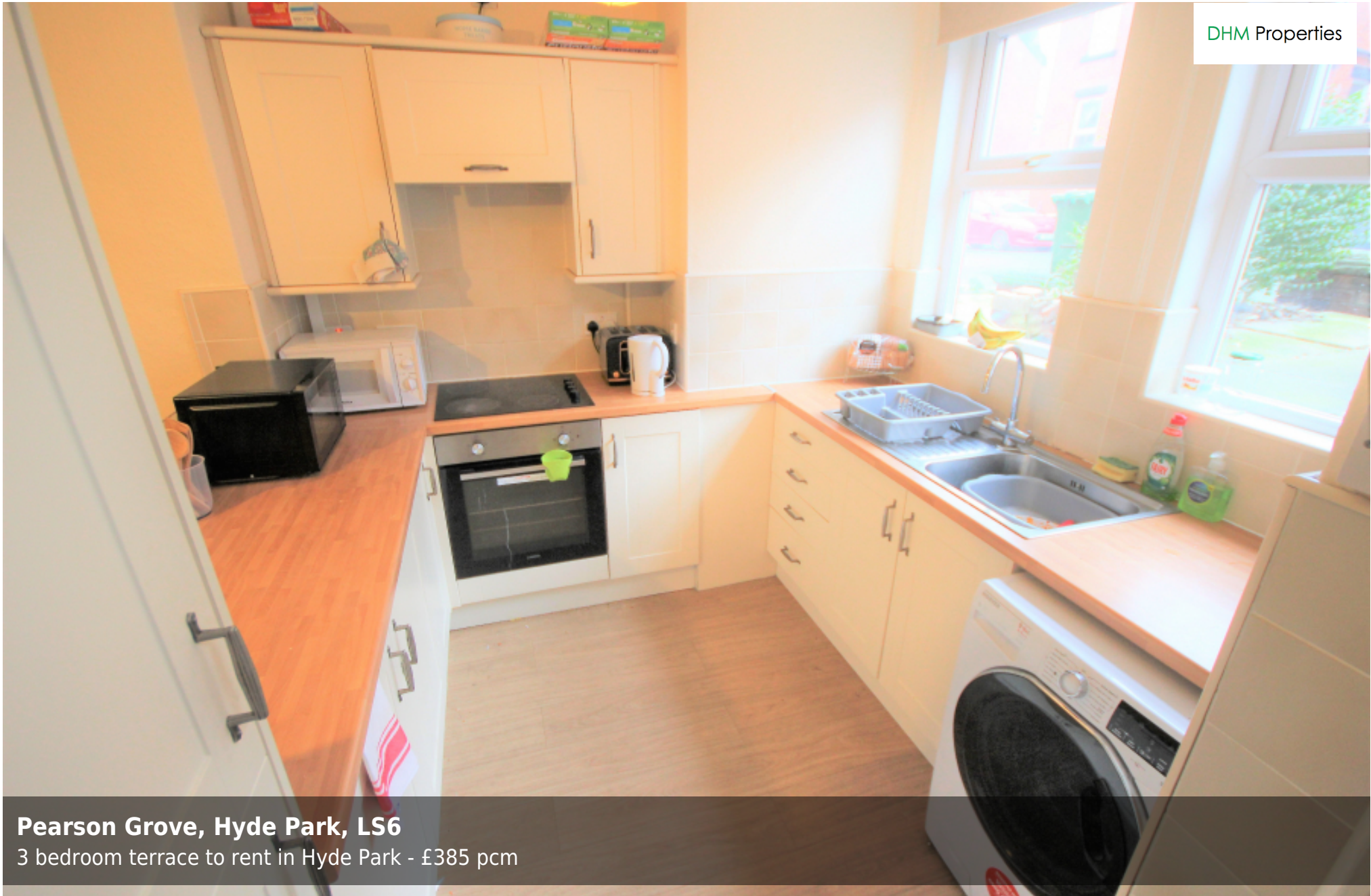
Pearson Grove, Hyde Park, LS6 3 bedroom terrace to rent in Hyde Park - £385 pcm