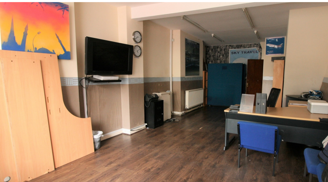
1 Bedroom flat & commercial ground floor retail Shop.