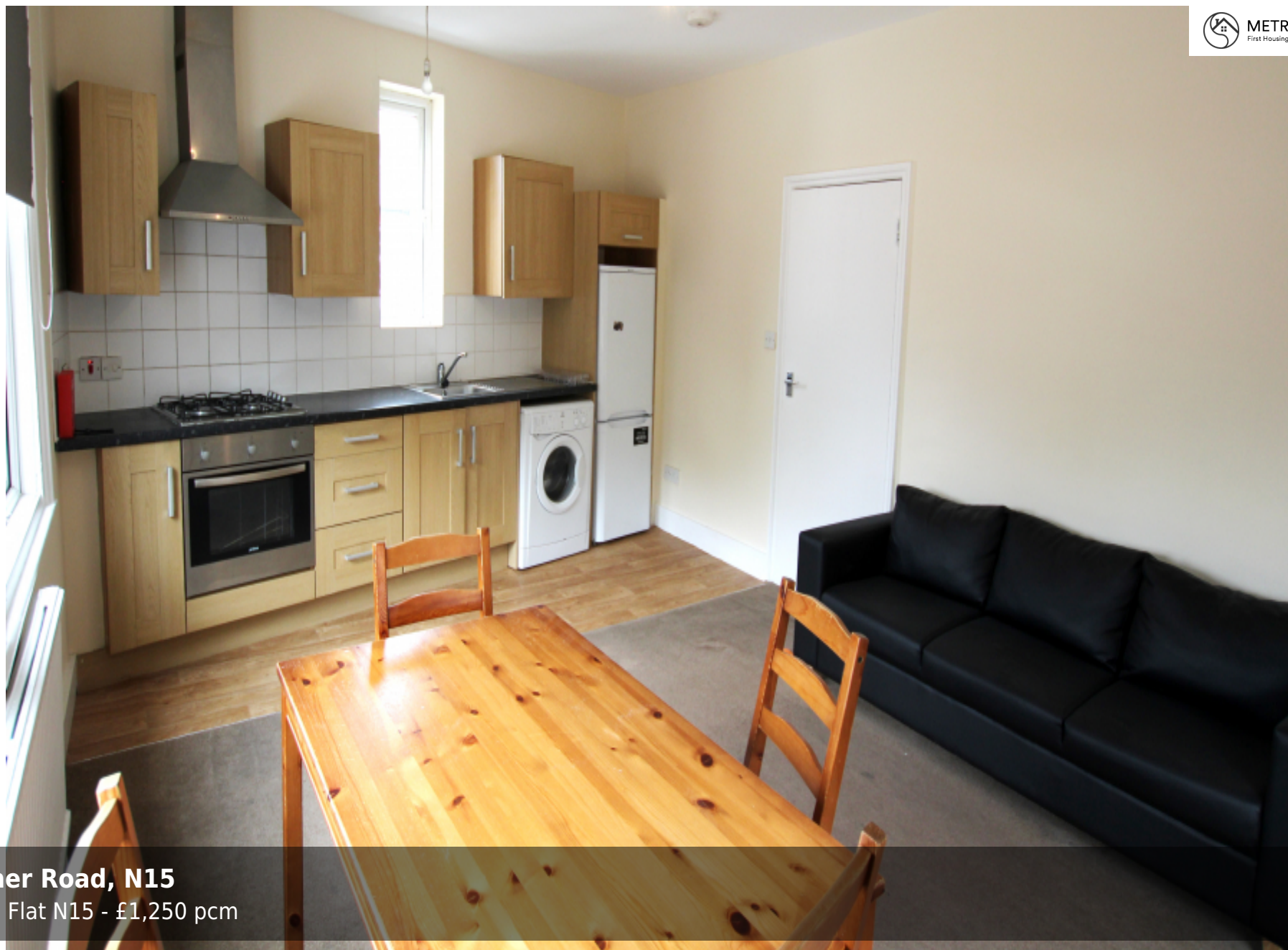
Falmer Road, N15 2 Bed Flat N15 - £1,250 pcm