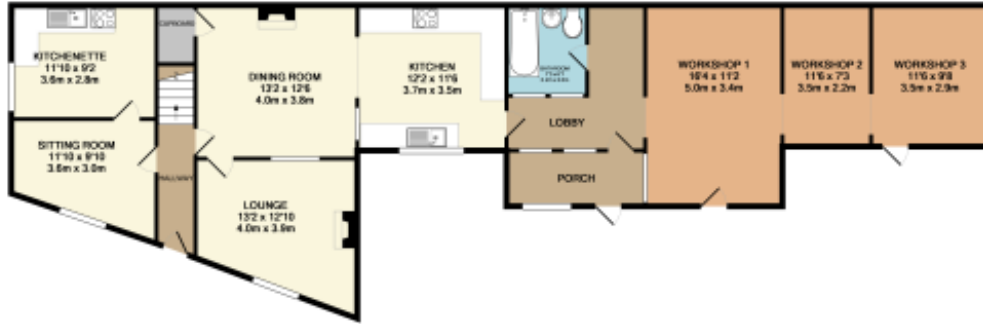
GROUND FLOOR APPROX. FLOOR AREA (214 SQ.FT.) (19.4 SQ.M.)