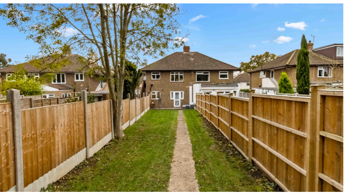
TWO BEDROOM MAISONETTE | Ground Floor | OVER 110 YEAR LEASE | Off-Street Parking | PRIVATE GARDEN | Modern Throughout | Close to Loughton Station...