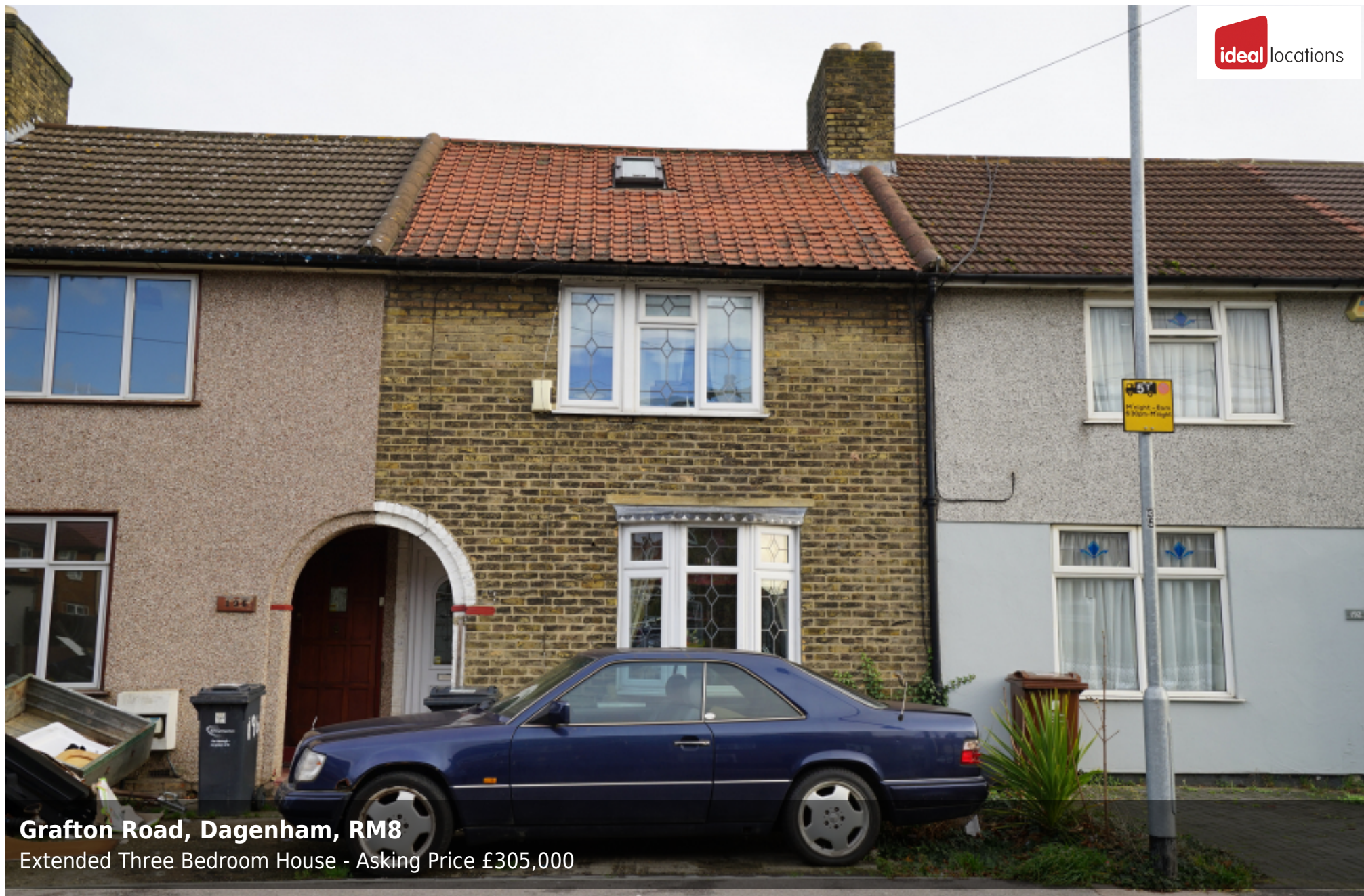
Grafton Road, Dagenham, RM8

Extended Three Bedroom House - Asking Price £305,000