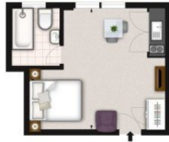
Illustration For Identification Purposes Only. Not to Scale *As Defined by RICS - Code of Measuring Practice

Approx. Gross Internal Area * 275 Ft 2 - 25.55 M 2