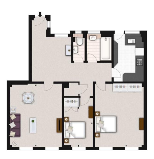
ILLUSTRATION FOR IDENTIFICATION PURPOSES ONLY. NOT TO SCALE * As Defined by RICS - Code of Measuring Practice

APPROX. GROSS INTERNAL AREA * 820 Ft 2 - 76.18 M 2