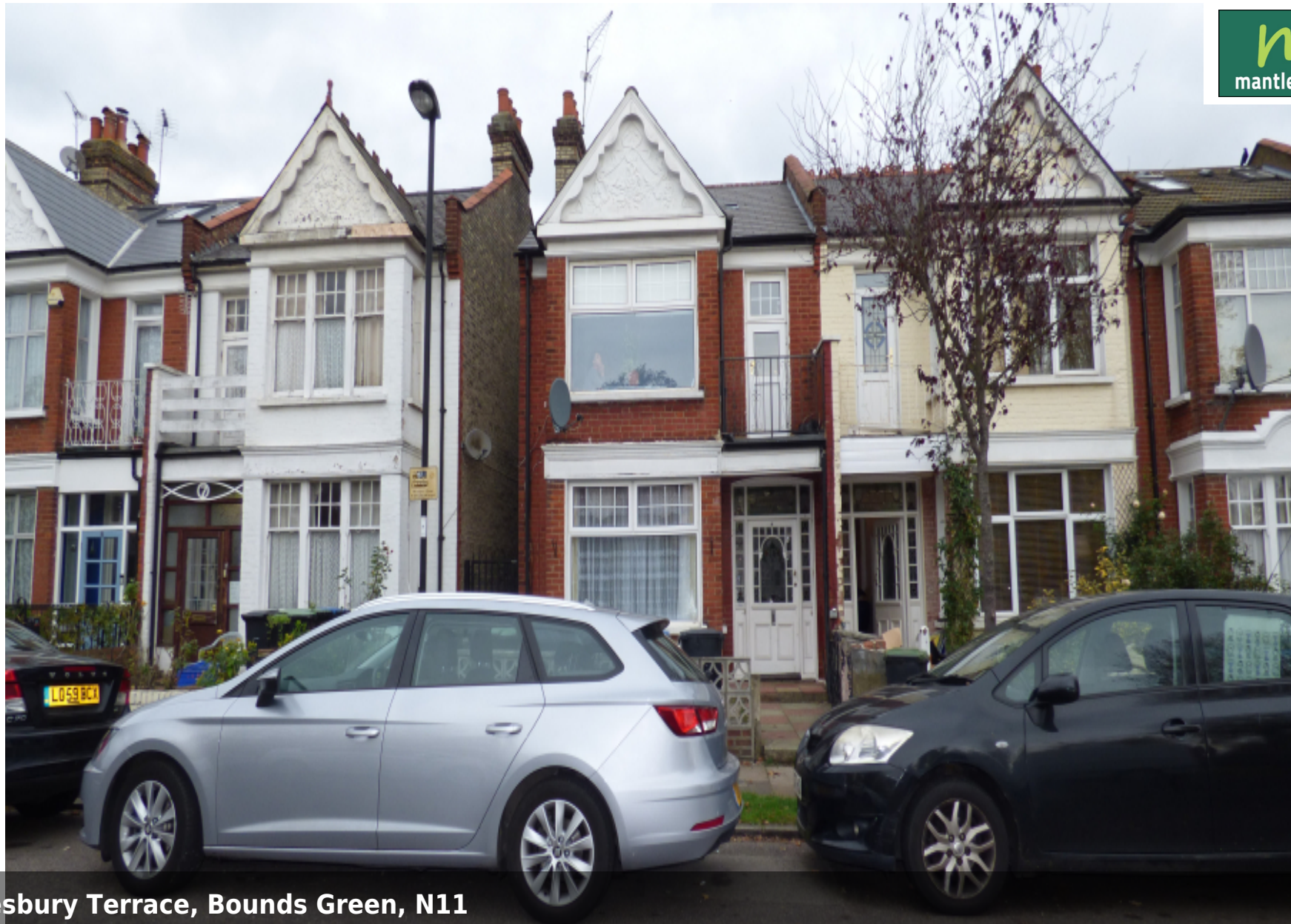
Tewkesbury Terrace, Bounds Green, N11 2 Bedroom first floor flat conversion to rent - £1,400 pcm