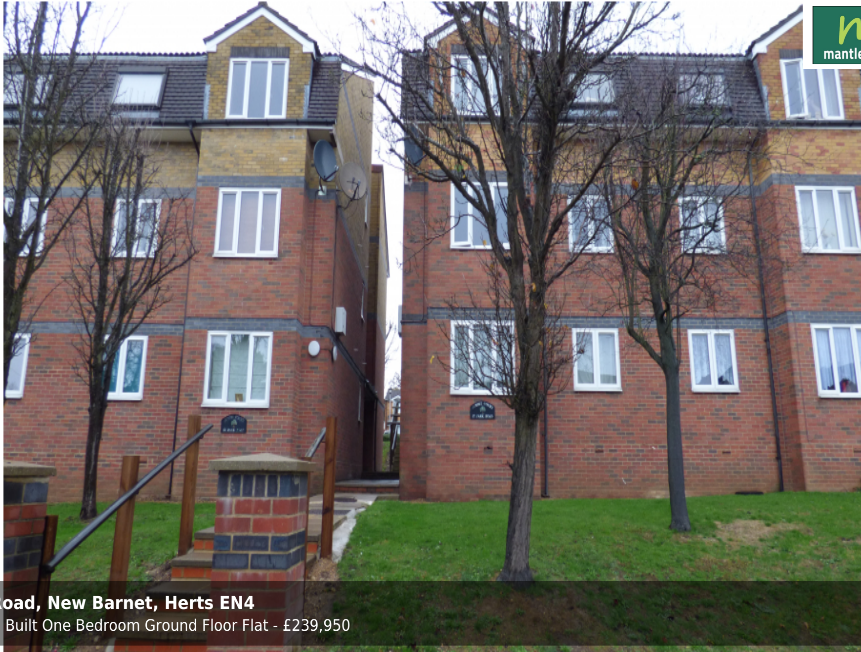
Park Road, New Barnet, Herts EN4 Purpose Built One Bedroom Ground Floor Flat - £239,950