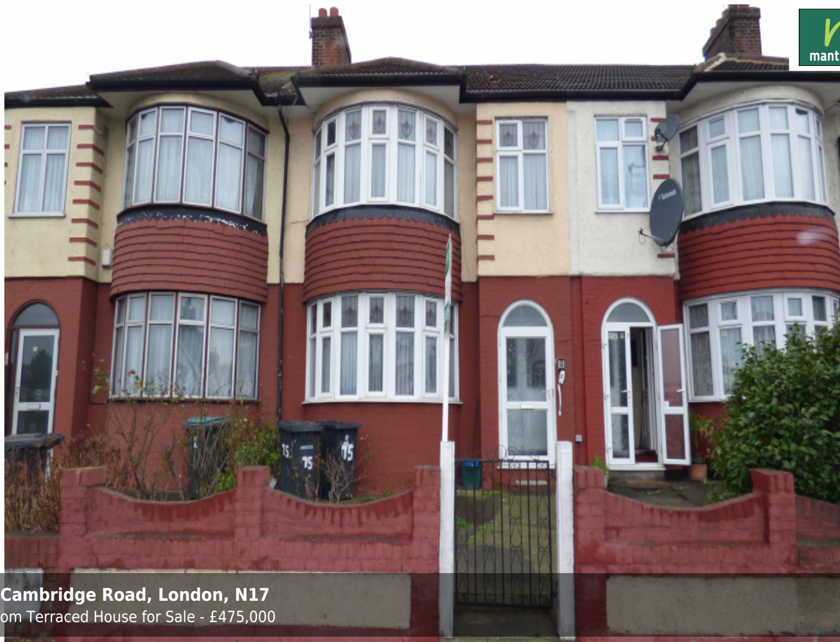
Great Cambridge Road, London, N17 3 Bedroom Terraced House for Sale - £475,000