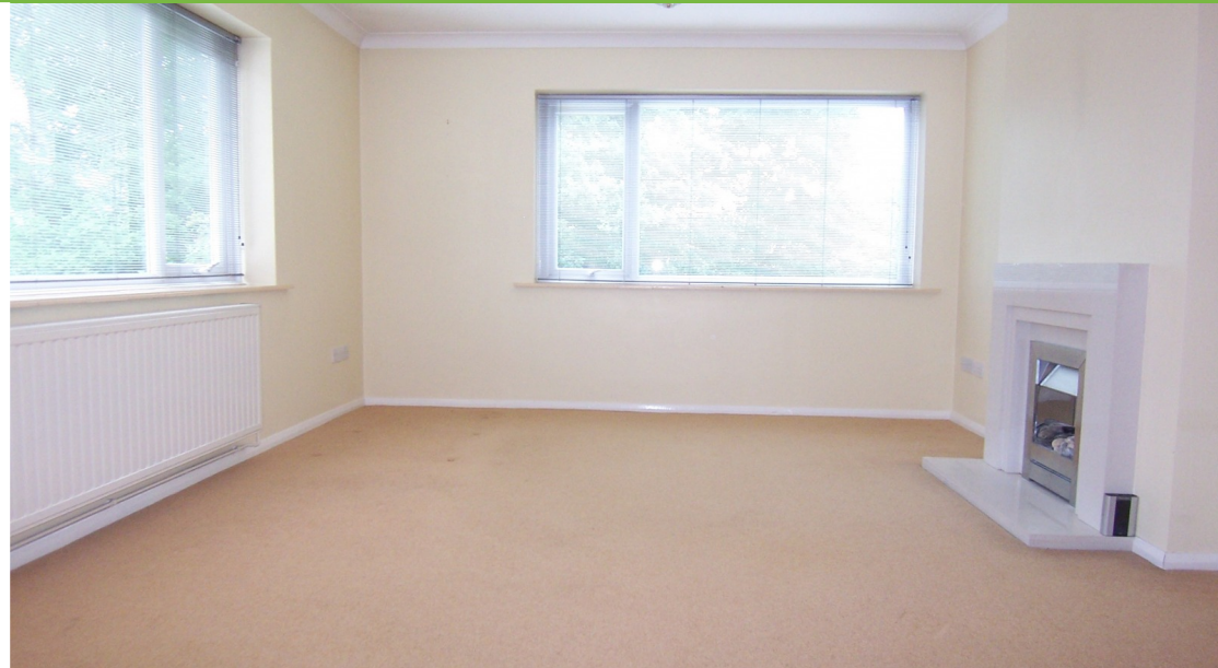
Two bedroomed apartment