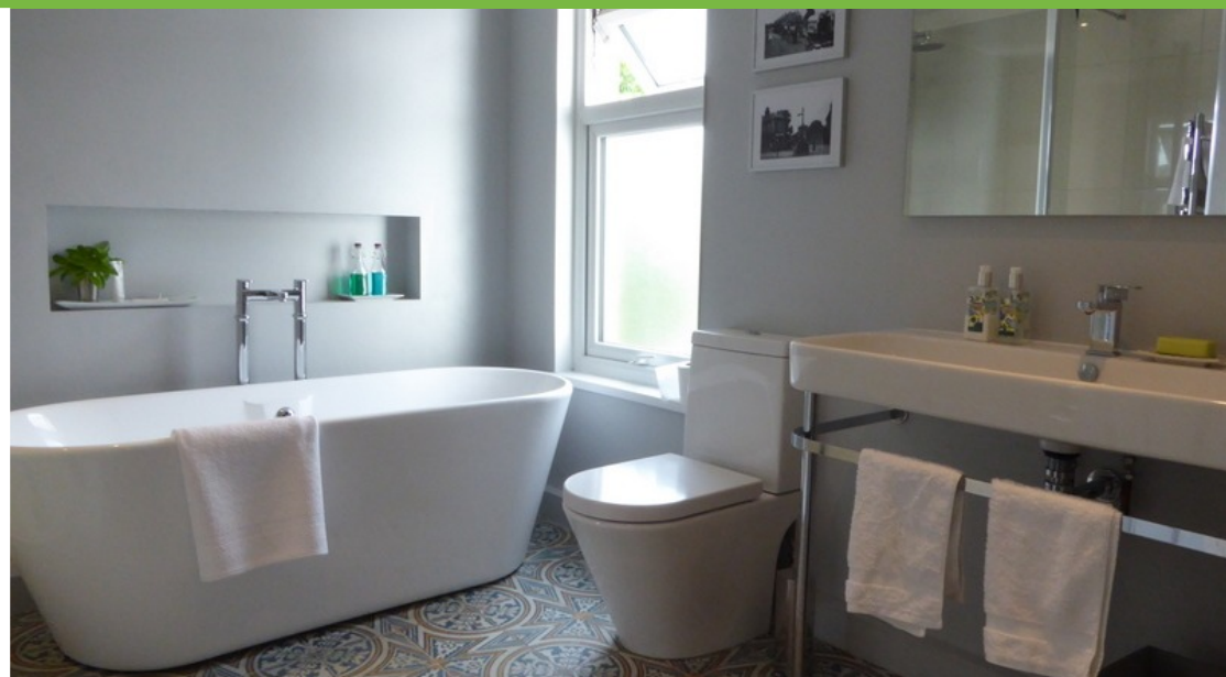
Two bedroom terraced house