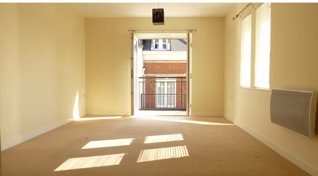
Two bedroomed apartment