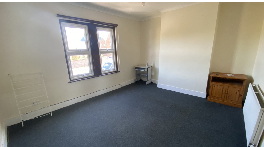
A great studio at an affordable price, in a convenient location