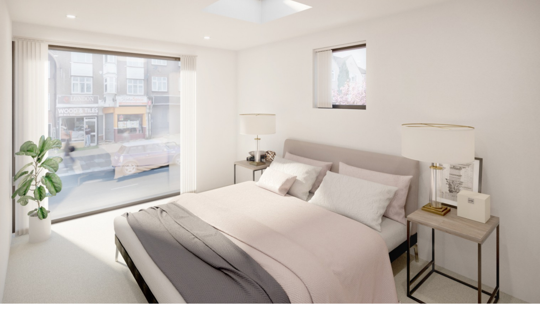
Luxury New Build 2 bedroom Freehold houses with gardens.