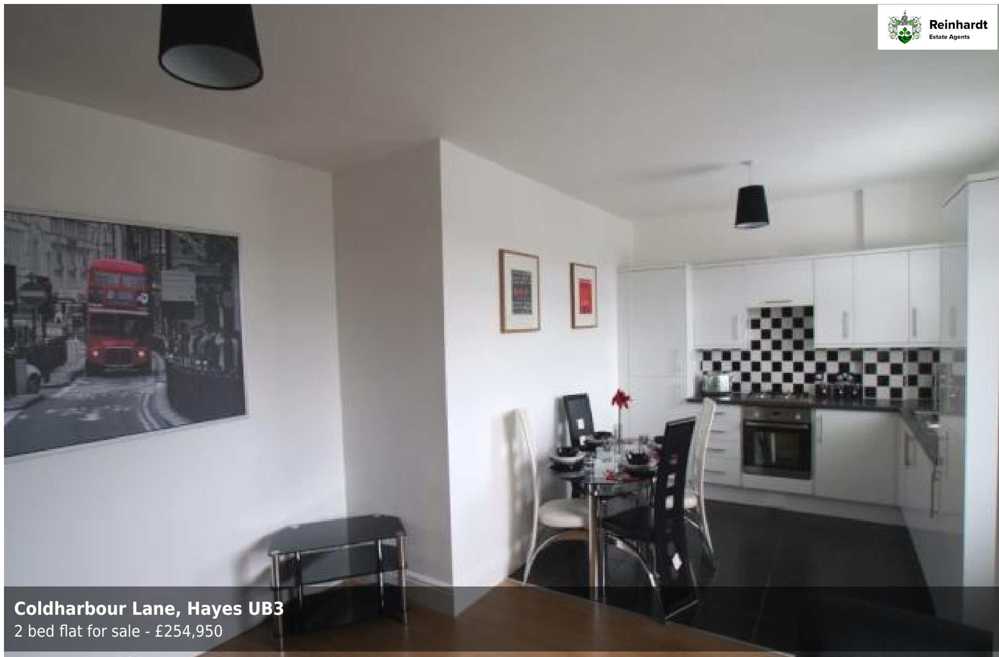
Coldharbour Lane, Hayes UB3 2 bed flat for sale - £254,950