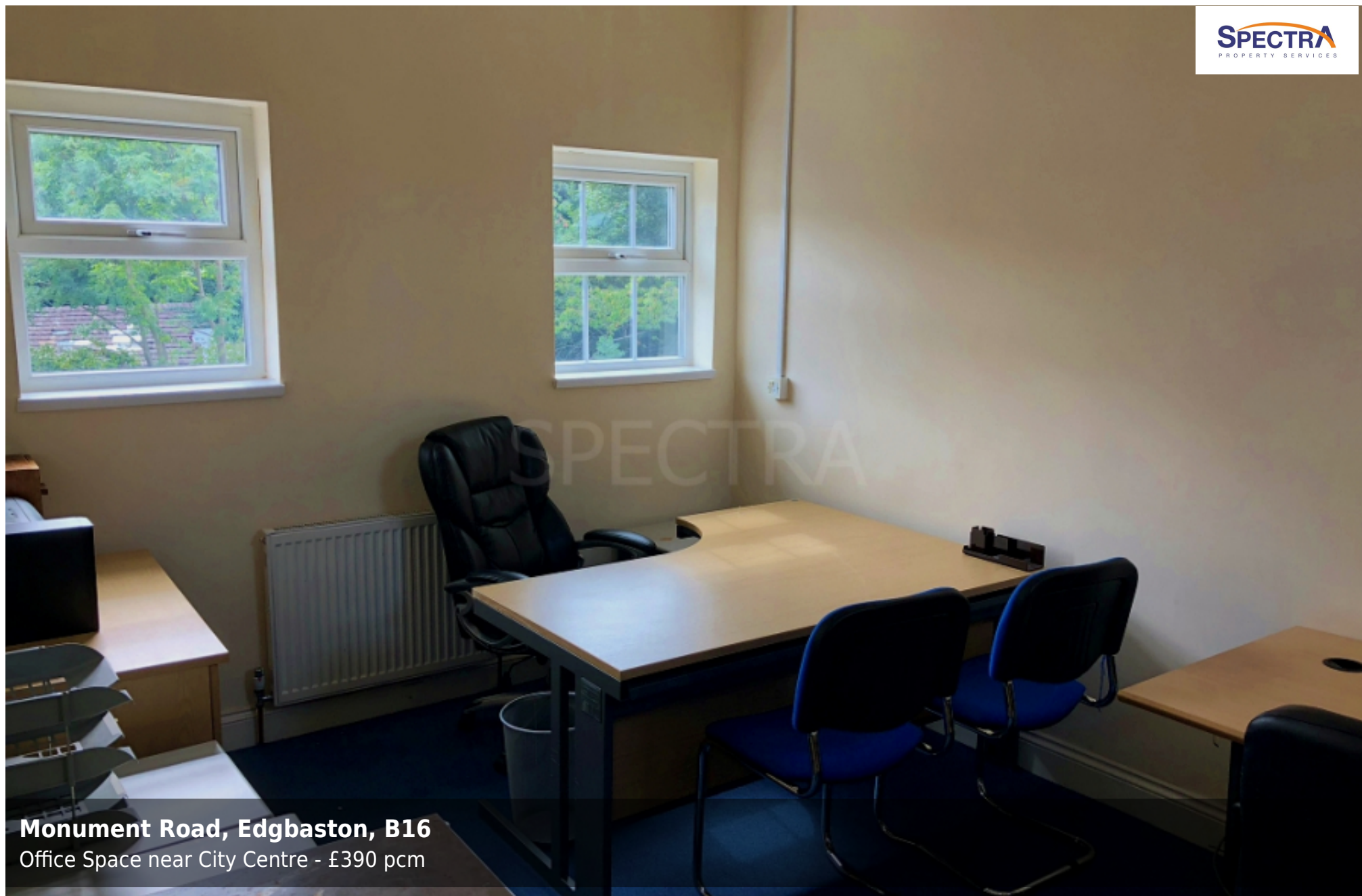
Monument Road, Edgbaston, B16 Office Space near City Centre - £390 pcm