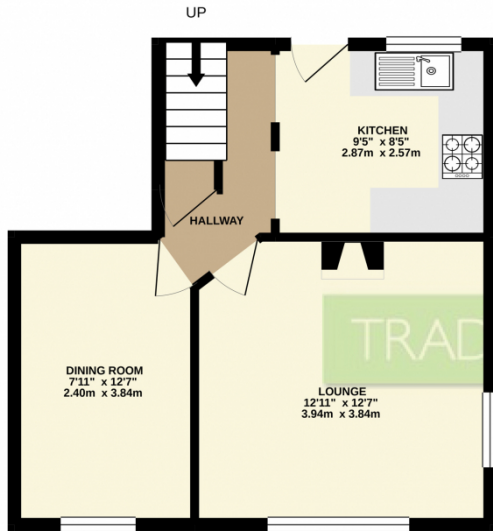
1ST FLOOR 383 sq.ft. (35.5 sq.m.) approx.