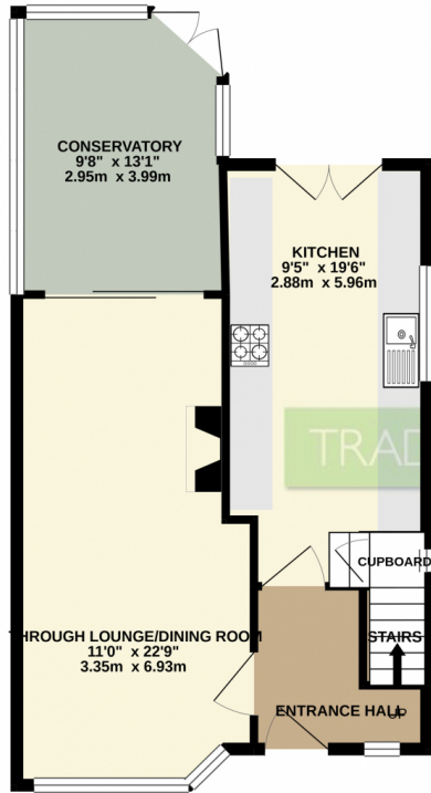
GROUND FLOOR 585 sq.ft. (54.4 sq.m.) approx.