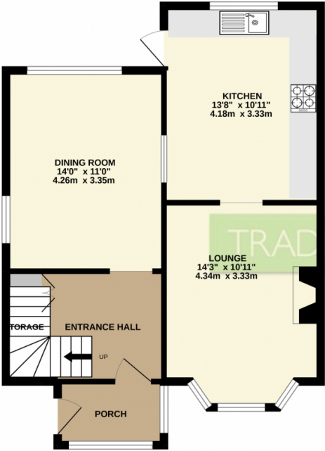
GROUND FLOOR 562 sq.ft. (52.2 sq.m.) approx.