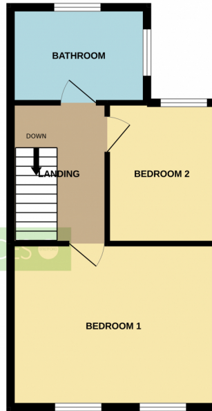
1ST FLOOR 381 sq.ft. (35.4 sq.m.) approx.